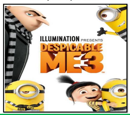
Reception Movie Night Friday 26<sup>th</sup> April 2024