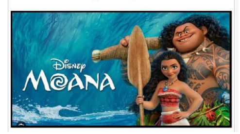
Year 1 Movie Night Friday 26<sup>th</sup> April 2024